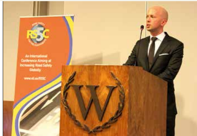
The closing remarks were made by Erik Bromander, State Secretary to the Swedish Minister for Infrastructure.

There is a great necessity for global cooperation to stop the growth of traffic fatalities. These three days during RS5C the 150 participants exchanged knowledge, information and experience from success stories and good practice regarding road safety and had the opportunity to create new