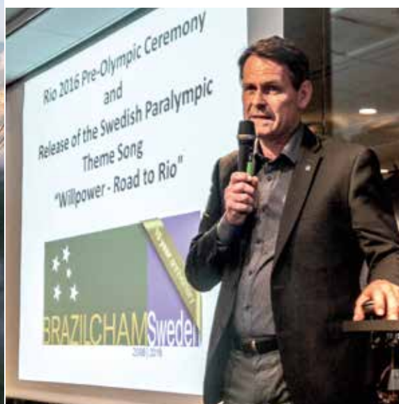
Peter Reinebo, CEO for the Swedish Olympic Committee, during the Rio 2016 Pre-Olympic ceremony in Stockholm on June 16.