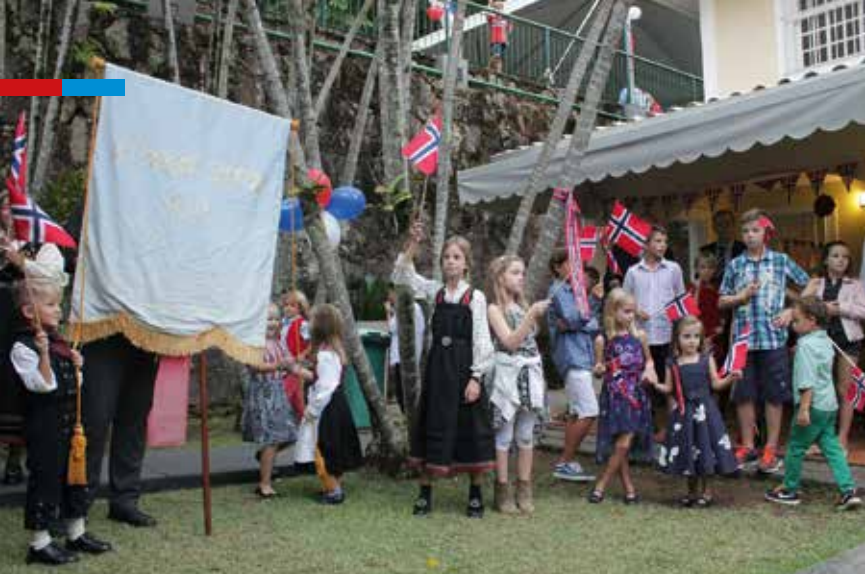
A party in red, white and blue, children in traditional Norwegian costumes, flags and songs marked the Norway Day celebration at the Norwegian Church.