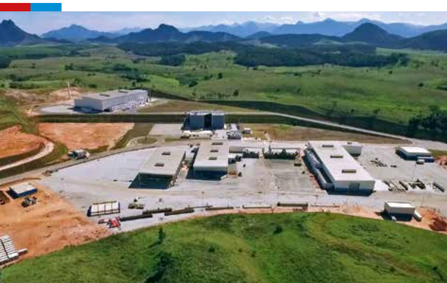
Aerial photo of the new plant.