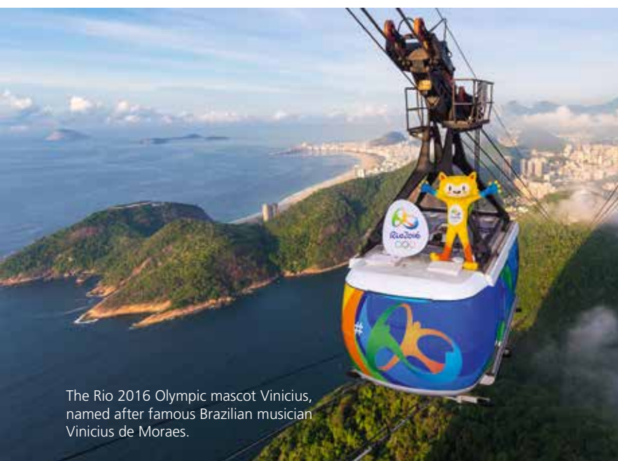
The Rio 2016 Olympic mascot Vinicius, named after famous Brazilian musician Vinicius de Moraes.