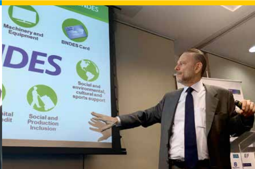
Luciano Coutinho during his presentation at the Chamber.

Coutinho gave a presentation on: "What Brazilian companies should expect from BNDES support over the next few years and the bank's new financing model". He talked to