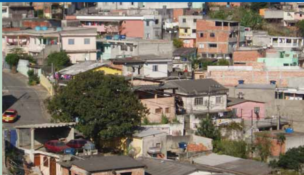
"Favela" in Taboão da Serra.

Many people in these areas lack jobs, which of course leads to both economic and social problems. Many men are involved in drug trafficking and as a result many of them are in prison due to drug-