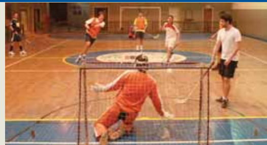
Shot taken during one of the weekly training sessions organized by ABF.

To achieve both objectives of more players and contributors, ABF is investing