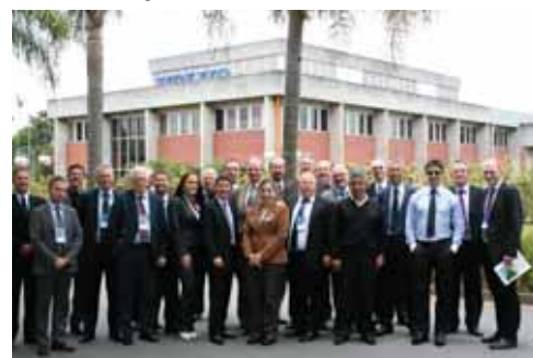
Go Global delegation visit to Volvo do Brasil.

Due to the high interest in the Brazilian market by Scandinavian auto parts makers, SouthPartner gave an additional one-day seminar in Jönköping, Sweden, in February 2011 to the companies that could not take part in the Go Global Brazil event in 2010. The seminar in Sweden included presentations on the Brazilian economy, the automotive industry as well as information on how to best get established in Brazil. ■