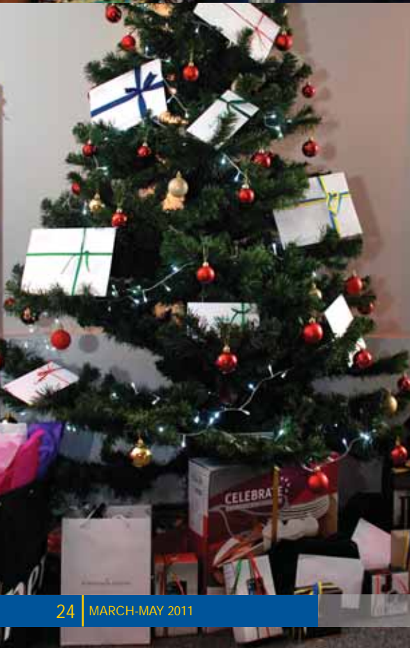
◀ Christmas tree with raffle prizes in Swedcham's lounge.

We would like to take this opportunity to extend our warmest thanks to our sponsors for the evening: Absolut, Buffet Cicareli, EF, Electrolux, Gant, Hillman, Kinnarps, Kuehne + Nagel, Laeder, Nespresso, Pontolink, Quality Inn, Scandinavia Designs, Scandinavian Steel AB, Sony Ericsson, Thule and Volvo Cars.