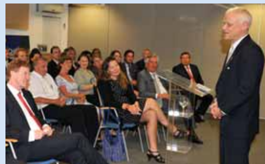
The Tillväxtanalys event attracted a large audience.

The Swedish Agency is entrusted by the Government to shed light on the areas most significant to growth. The Agency's overriding objective is to strengthen Swedish competitiveness and create the conditions for more jobs in more companies throughout the country. It conducts evaluations, analyses and statistical studies with a broad Swedish and international perspective. The Agency's work relies on science and reliable experience, and its knowledge base will form the basis of political decisions in the Government and the