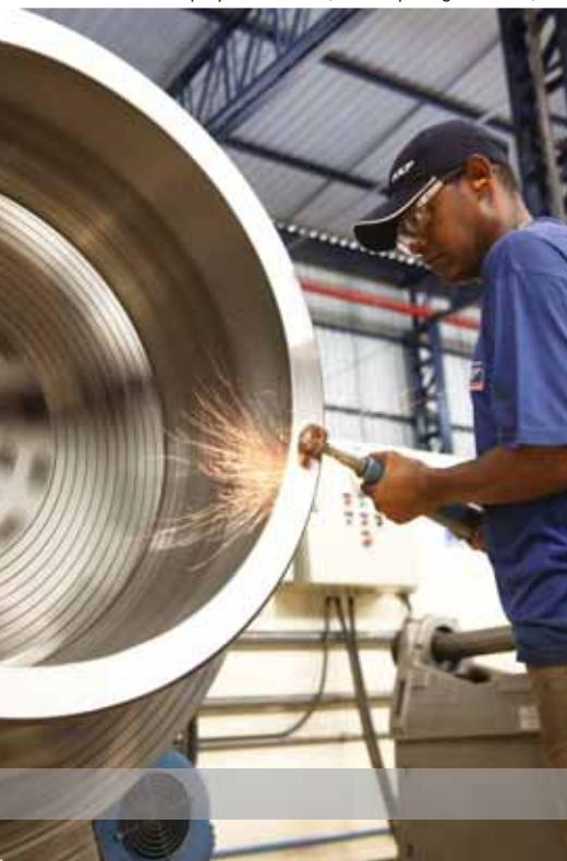
SKF employee at work.

Sustainability, for SKF, means to look after the business and take care of the collaborators, the community and the environment. "To this end, we have developed activities and programs that focus on these four columns to ensure the sustainable growth of our operations. For instance, with regard to collaborators, our goal is to keep SKF do Brasil as one of the best companies to work for. That is why the work atmosphere must be inspiring, innovative, challenging and