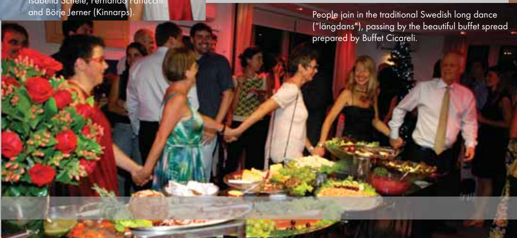
People join in the traditional Swedish long dance ("långdans"), passing by the beautiful buffet spread prepared by Buffet Cicareli.