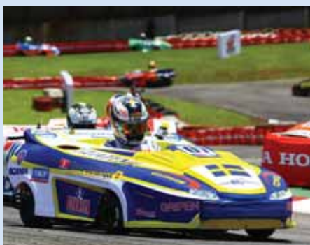
The Racing Team Sweden (RCS) car

Sweden will be present once again, and next year promises to attract major celebrities. Stay tuned to this magazine and we will tell you all about it! ■