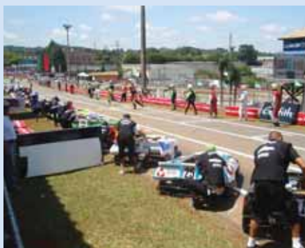
General overview before the race.