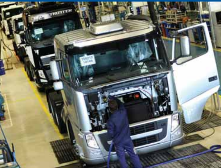
Volvo do Brasil production line in Curitiba, Paraná State.

Volvo in Brazil in 2010? Could you give us a forecast for the end of the year?