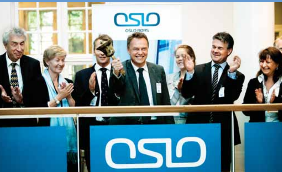
Listing of Panoro Energy on Oslo Stock Exchange on June 8 this year.

P anoro Energy ASA ("PEN") is a newly listed independent company involved in exploration and production of oil and natural gas offshore Brazil, as well as onshore and offshore in West Africa. The company has offices in London, Rio de Janeiro and Oslo and was listed on the Oslo Stock Exchange under the ticker "PEN" on June 8, 2010.