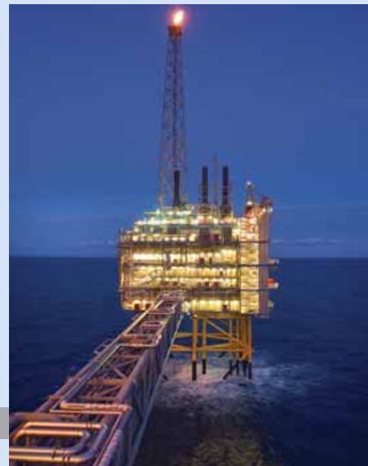
Sleipner offshore platform

The Working Group for the Brazil Strategy recently visited Brazil, from October 4 to 8. They visited Santos, São Paulo, Brasília and Rio de Janeiro – and had meetings with lots of representatives for various authorities and institutions in Brazil, as well as representatives of Norwegian interests. They have just gone back to Norway, and their visit – and the impressions from Brazil, like a snapshot of Brazil of today, and of Norwegian interests – will form the basis of the first draft of the Strategy. The final version will be presented sometime early next year. ■