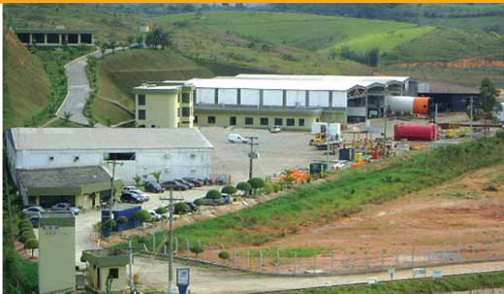
Five Star Services facilities in Macaé