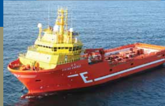
OSV powered by LNG fuel operating since 2003

N owadays, corporate responsibility with the environment is a reality in most businesses worldwide. For DNV, whose vision is to have "Global impact for a sustainable future", the topic has been integrated at a corporate level long ago and presently addresses the maritime industry's most innovative trend, the LNG as fuel.