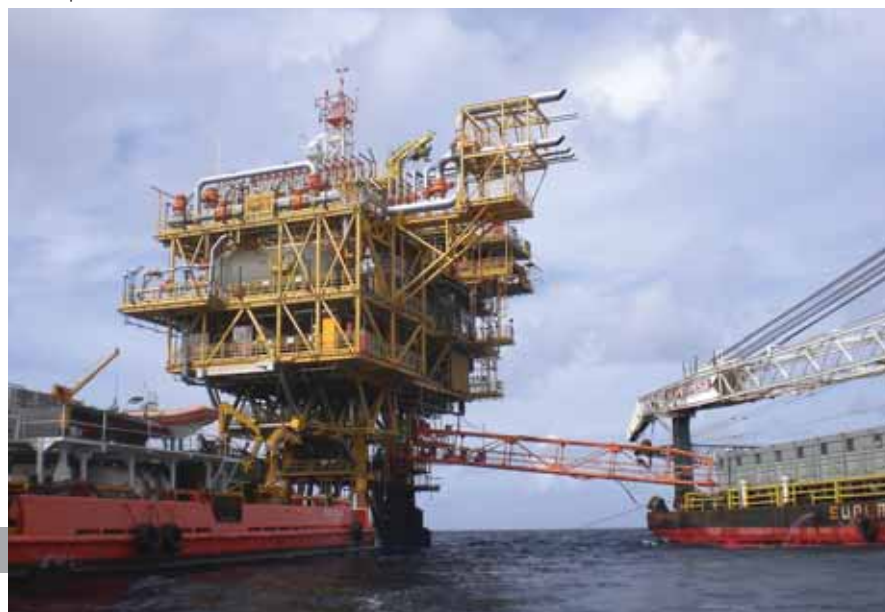
Manati platform at Camamu-Almada Basin in Brazil.

In the offshore Santos Basin, Panoro Energy has an interest in three oil discov-