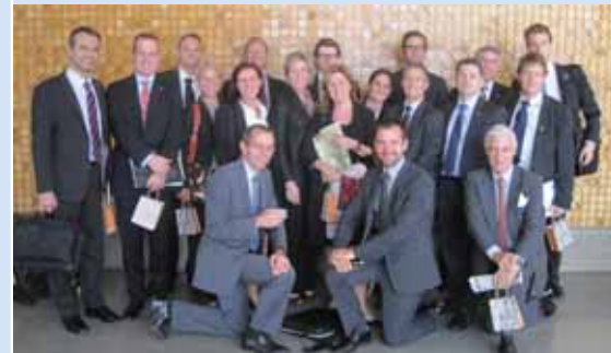
The Novare/Investor group during their visit to Natura on October 13.

October 12-18 - Visit Novare/Investor Group